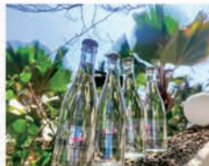
Zero plastic policy at Diani Reef Beach Resort & Spa