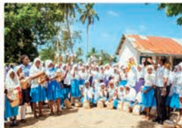
Supporting girls' education and mitigating drought in Kwale County through monthly donations

WE LOOK FORWARD TO WELCOMING YOU SOON TO DIANI REEF BEACH RESORT & SPA!