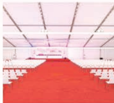
Diani Reef Convention Centre