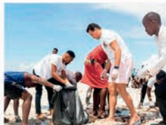
Diani Reef staff, guests, and local residents collaborate in beach cleaning initiatives

At Diani Reef Beach Resort & Spa, we recognise the critical importance of sustainability in achieving our business goals and fulfilling our responsibilities to the environment and the community in which we operate. We are committed to conducting our business in a way that minimises our impact on the environment, conserves natural resources, empowers the local community and fosters social and economic development.