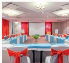
Shark 2 Conference Hall