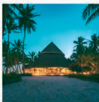
Fins Beach Bar & Grill