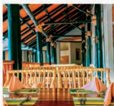
Coral Rock Cafe

The Fins Beach Bar & Grill serves sizzling fresh fish and meat as well as light Mediterranean dishes. After an eventful day, unwind in a lively ambiance at our Zebra Square Bar & Piano Lounge. Whether you're looking to dance the night away, enjoy a few drinks with friends, or meet new people, Zuri Disco is the place to be.