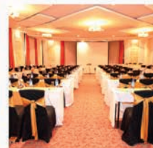
Shark 1 Conference Hall