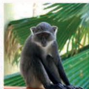
Colobus conservation, Diani Turtle Watch and Diani Whale Shark Trust Support