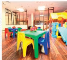
Coco Jambo Kids Club